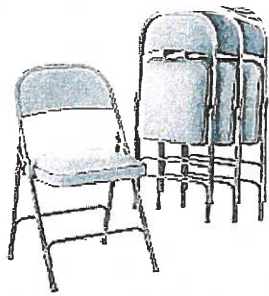
TABLE AND CHAIR INVENTORY