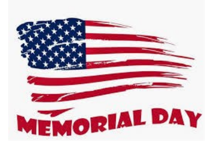
Pool Hours for the Memorial Day weekend (Saturday, 5/25–Monday, 5/27) are Noon-6:00 PM.

The Clubhouse is open on Memorial Day (Monday, 5/27 from 11:00 AM-6:00 PM.